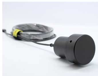
Dual Frequency Echosounder Unit