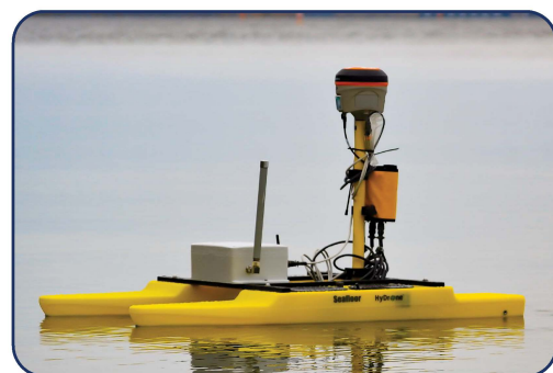
Unit can be integrated into remote / autonomous vessels

Seafloor Systems, Inc. | 4415 Commodity Way | Shingle Springs, CA 95682 | USA