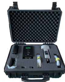
Rugged Shipping Case